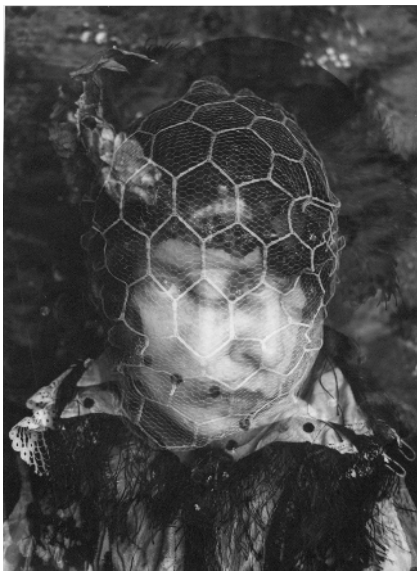
Gertrud Arndt, Maskenfoto Nr. 16, 1930, Bauhaus-Archiv Berlin