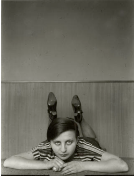
Gertrud Arndt, Selbstporträt im Atelier, Bauhaus Dessau, 1926, Bauhaus-Archiv Berlin © VG Bild-Kunst, Bonn 2026