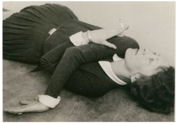
Grit Kallin-Fischer, Selbstporträt mit Zigarette, um 1928, Bauhaus-Archiv Berlin