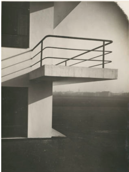
Architekt: Walter Gropius, Bauhaus-Gebäude Dessau (1925-1926), Balkon am Ateliergebäude, 1926