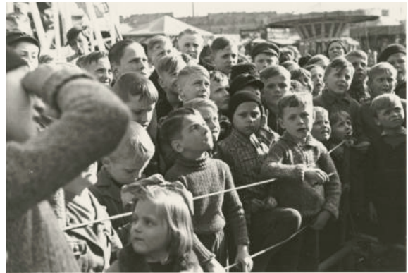
Marianne Brandt, Wartende Kinder, 1928, Bauhaus-Archiv Berlin