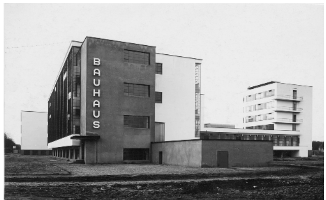
Lucia Moholy, Architekt: Walter Gropius, Bauhaus-Gebäude Dessau (1925-1926), 1927