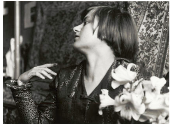
Marianne Brandt, Selbstporträt mit Lilien, um 1923, Bauhaus-Archiv Berlin