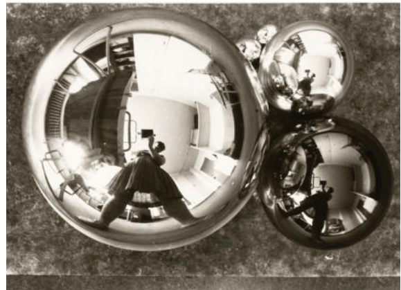
Marianne Brandt, Selbstporträt mit Kamera im Atelier in der Kugel gespiegelt, Bauhaus Dessau, um 1928 - 1929