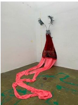
Petrit Halilaj, Do you realise there is a rainbow even if it is night!? (coral) , 2025, Qilim Teppich aus Kosovo, Flokati, Polyester, Chenilledraht, Edelstahl, Messing / Qilim Carpet from Kosovo, flokati, polyester, chenille wire, stainless steel, brass 280 x 170 x 45 cm