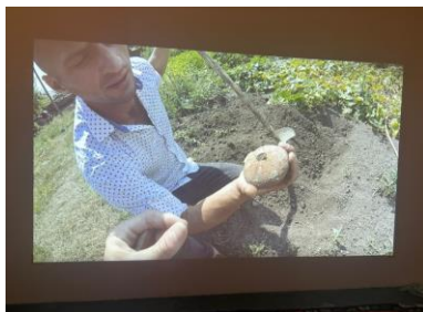
Petrit Halilaj, The city roofs were so near that even a sleepwalking cat could pass over Runik without ever touching the ground , 2017, HD-Video, 26'55", Edition 1/5 + II AP