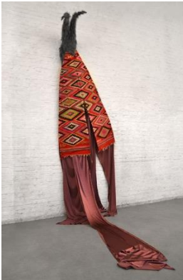
Petrit Halilaj, Do you realise there is a rainbow even if it's night!? (mauve) , 2017, Dyshek Teppich aus Kosovo, Flotaki, Polyester, Chenilledraht, Edelstahl, Messing / Dyshek Carpet from Kosovo, flokati, polyester, chenille wire, stainless steel, brass 275 x 122 x 30 cm

presse@smb.spk-berlin.de www.smb.museum/presse