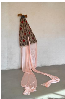
Petrit Halilaj, Do you realise there is a rainbow even if it's night!? (pink), 2017, Qilim Teppich aus Kosovo, Flokati, Polyester, Chenilledraht, Stahl, Messing / Qilim Carpet from Kosovo, flokati, polyester, chenille wire, steel, brass 232 x 134 x 17 cm