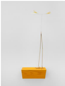
Petrit Halilaj, Here to Remind You (Amazona Albifrons, Ara Cacatua), 2025, Messing, Naturfeder / Brass, natural feather 142 x 50 x 21 cm