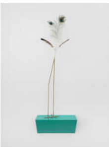
Petrit Halilaj, Here to Remind You (Pavo Cristatus, Maleagris Gallopavo), 2025, Messing, Naturfeder / Brass, natural feather 152 x 50 x 25 cm