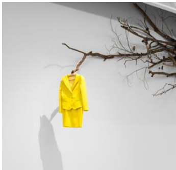
Petrit Halilaj, I'm hungry to keep you close. I want to find the words to resist but in the end there is a locked sphere. The funny thing is that you're not here, nothing is, 2014, verschiedene Materialien / various materials Größe variiert / dimensions variable