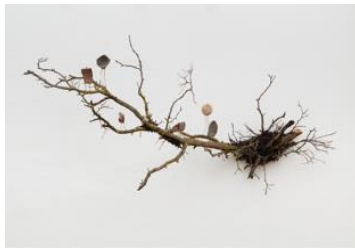
Petrit Halilaj, RU, 2017/2022, Holz, Erde, Klebstoff, Messing, Harz, sieben Skulpturen unterschiedlicher Größen / Wood, earth, glue, brass, resin, seven sculptures of different sizes