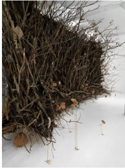
Petrit Halilaj, RU (Aves Migrantis), 2027/2022, Holz, Erde, Klebstoff, Messing, Harz, 79 Skulpturen unterschiedlicher Größen / Wood, earth, glue, brass, resin, earth, 79 sculptures of different sizes

HAMBURGER BAHNHOF – NATIONALGALERIE DER GEGENWART