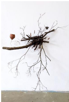
Petrit Halilaj, RU, 2017/2022, Holz, Erde, Klebstoff, Messing, Harz, fünf Skulpturen unterschiedlicher Größen / Wood, earth, glue, brass, resin, five sculptures of different sizes

presse@smb.spk-berlin.de www.smb.museum/presse