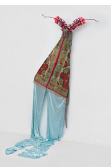
Petrit Halilaj, Do you realise there is a rainbow even if it's night!? (sky blue), 2023, Qilim Teppich aus Kosovo, Flokati, Polyester, Chenilledraht, Edelstahl, Messing / Qilim Carpet from Kosovo, flokati, polyester, chenille wire, stainless steel, brass, 230 x 150 x 40 cm

HAMBURGER BAHNHOF – NATIONALGALERIE DER GEGENWART