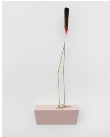
Petrit Halilaj, Here to Remind You (Maleagris Gallopavo, Ara Macao), 2025, Messing, Naturfeder / Brass, natural feather, 142 x 50 x 25 cm