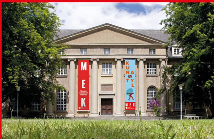
Entrance MEK, Arnimallee 25

different origins as well as the effects of these contacts on society, both in the past and present. In doing so, we consider culture and identity to be dynamic, fluent and diverse. Both culture and identity are closely linked to each other and change when people encounter one another. It is our aim to render this visible, which is why we feel it is imperative to also collect objects from the present day and to cooperate with different people and groups, and, by doing so, to accompany current social and cultural processes. We aim to promote intercultural dialogue in order to overcome prejudices and stereotypes.